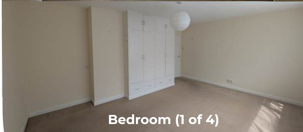
Bedroom (1 of 4)