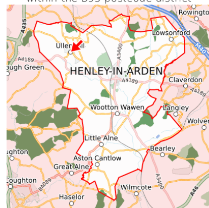
Map showing the position of Ullenhall within the B95 postcode district

The population of the civil parish as taken at the 2011 census was 717.