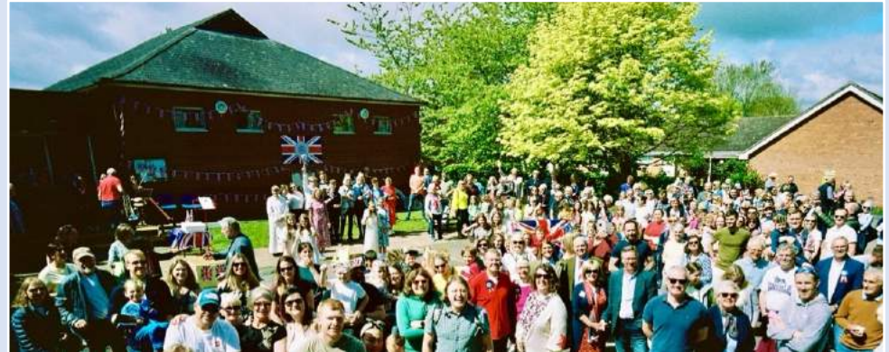
Coronation celebrations at the Church Centre

We hold more informal Sunday worship services, such as Bible Café, once a month in the Church Centre. It is also where our Youth club meets, and where Messy Church events such as the Easter workshop are held, bringing Jesus to young people and their families in a relaxed setting.