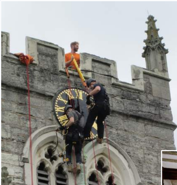
Refurbishing the turret clock