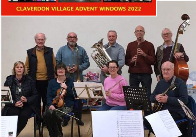
The West Gallery Band