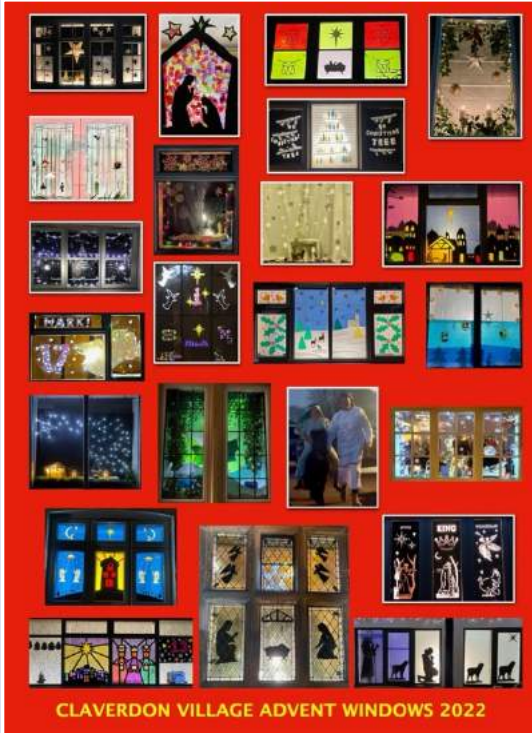
Throughout Advent a decorated window in a village house was lit each night, followed by a blessing, carol singing and refreshments. Hundreds of villagers joined in!