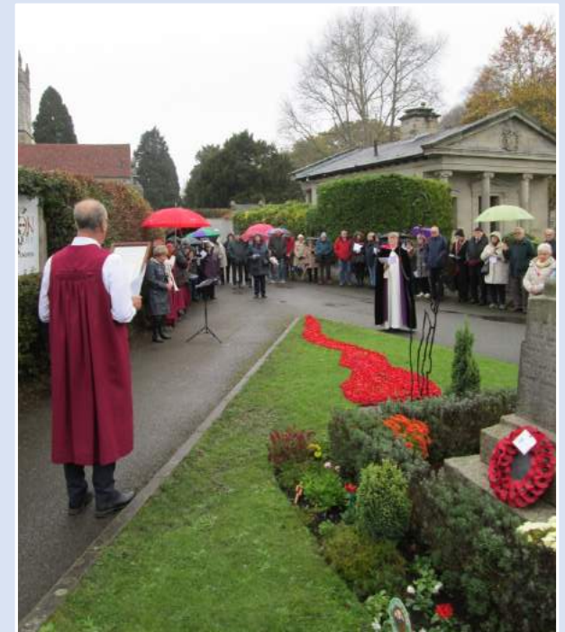
Remembrance Day 2023