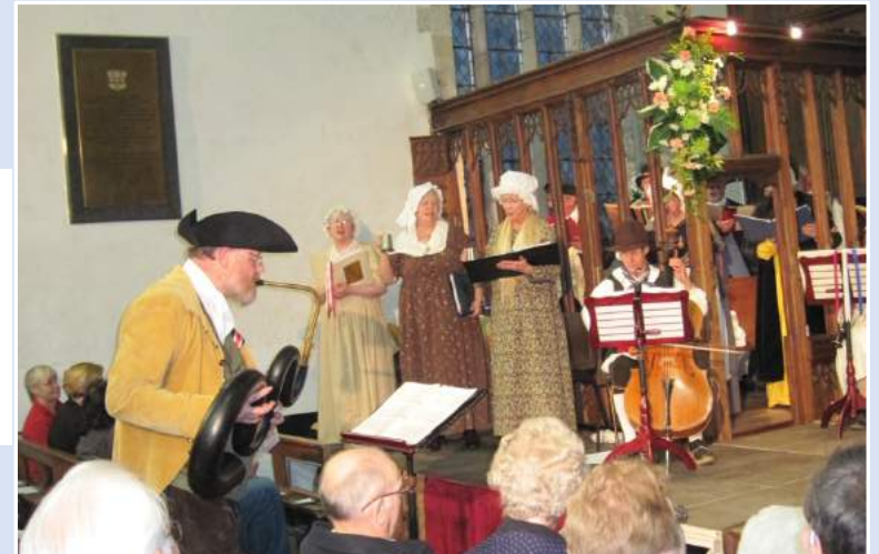
Immanuel's Ground – one of many concerts at St Peter's