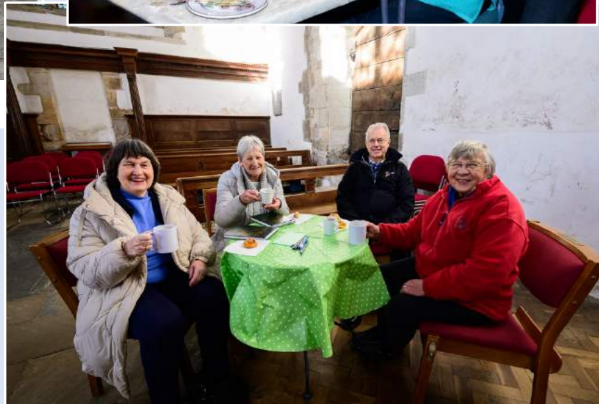
Café church, with coffee and pastries