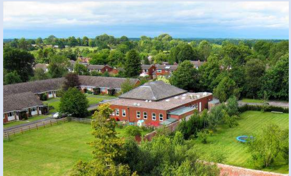
The Church Centre from the church tower