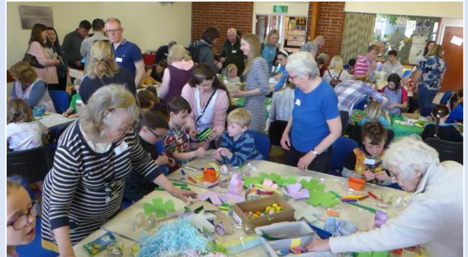
Easter workshop with 70 children, 2023