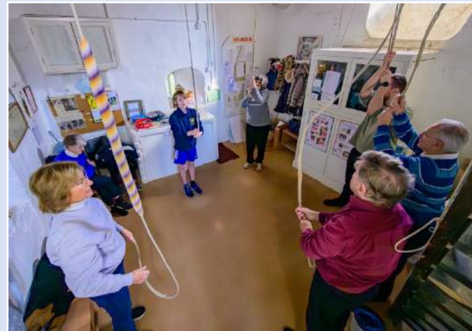
Ringing St Peter's 6 bells