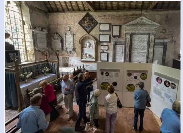
The new Saxon Sanctuary exhibition