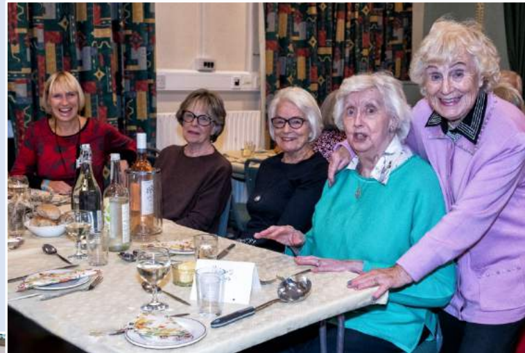
Harvest Supper, 2023