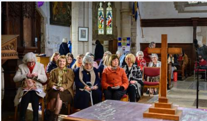
World Day of Prayer 2024