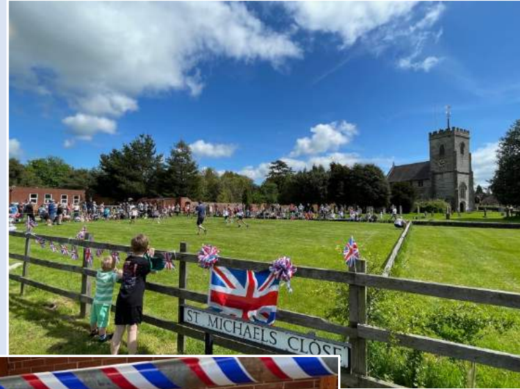
Children's games on the Glebe Field, May 2023. (Church Centre on the left)