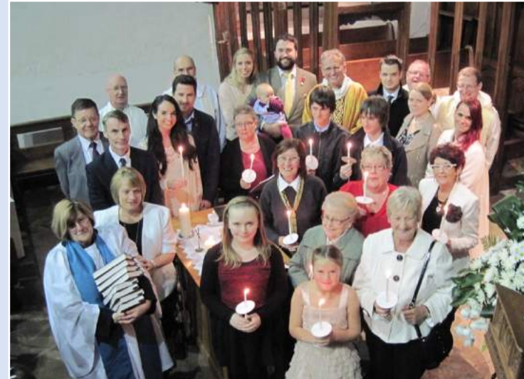
Confirmation service with the Bishop of Coventry