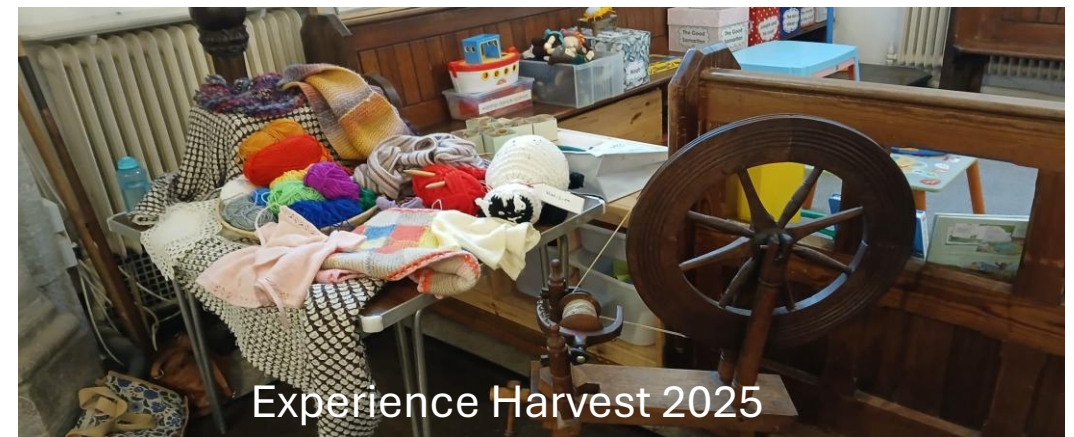
Experience Harvest 2025