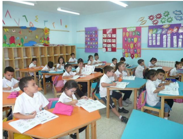
Children in one of the classrooms

The first intake of children took place in September 2003 with just 15 children of kindergarten age.